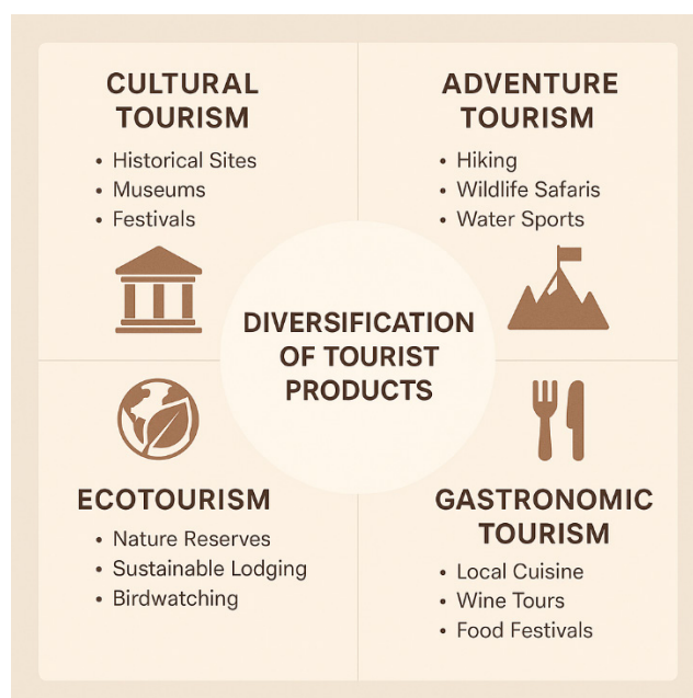
Figure 2. Niche tourism markets

Moreover, diversification improves destination competitiveness. Travelers increasingly seek personalized and authentic experiences, and diversified destinations can cater to niche markets such as cultural heritage, gastronomy, wellness, adventure, or spiritual tourism (Picture 1). However, successful diversification depends on institutional support, training, and infrastructure. The absence of coordinated planning can lead to fragmented or inauthentic products, undermining both quality and sustainability.